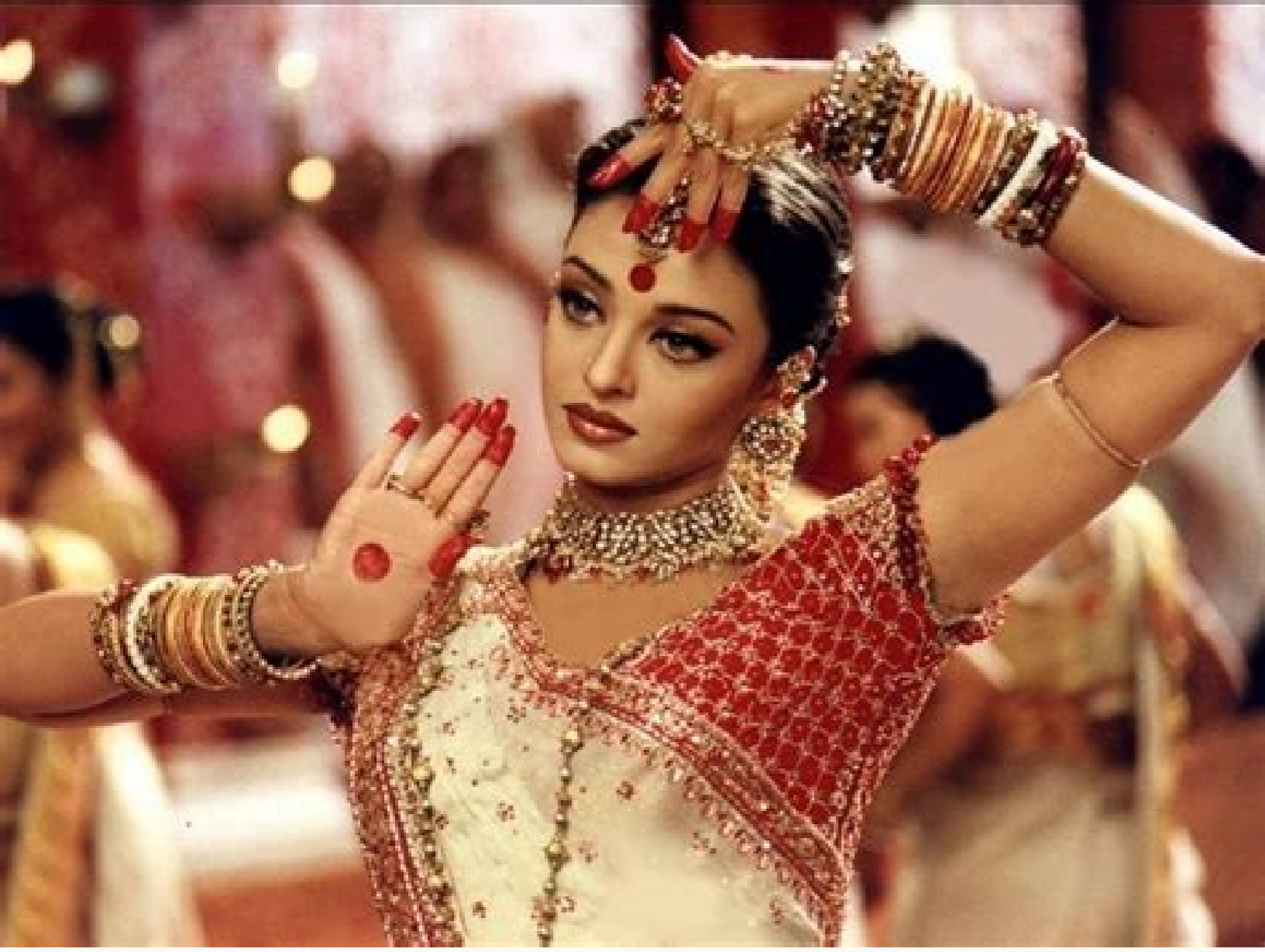
Abhishek bachchan aishwarya rai video song. Aishwarya rai bachchan video song. Aishwarya rai ranbir Kapoor video song. Best of aishwarya rai video song. Aishwarya rai all song video. Aishwarya rai umrao jaan video song. Aishwarya rai new video song. Aishwarya rai video song youtube.